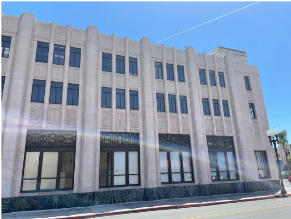
HPPA-2021-19 OLD SANTA ANA CITY HALL 217 NORTH MAIN STREET SITE PHOTOS